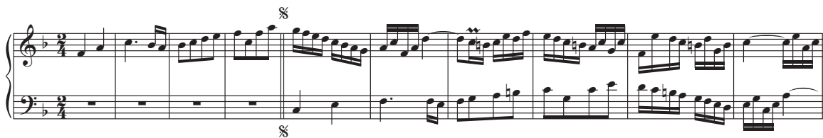
Example 2a: Beginning of the Duetto in F major (BWV 803), bb. 1-10